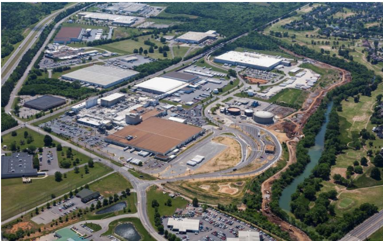
Aerial view of the General Mill's plant in Murfreesboro, TN.

General Mills, one of the world's largest suppliers of snack foods, cereals, and dairy-based products, operates a food processing complex in Murfreesboro, Tennessee. The campus has been steadily expanded since first opening in 1979 and, today, includes multiple processing and packing areas that produce Pillsbury bakery products and Yoplait yogurt.