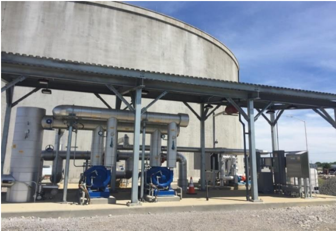
Biogas compression skid at the Yoplait plant.

The plant's 6.6 MG anaerobic digester produces in excess of 400 SCFM of biogas consisting of approximately 63 percent methane. At the plant's wastewater treatment plant the gas is scrubbed to remove siloxanes, moisture and other impurities. The gas is then compressed and piped underground from the wastewater plant to the facility where it is used to fuel the CAT 3520 reciprocating engine, the prime mover for the site's CHP system. The waste heat from the engine is recovered through a heat recovery loop and supplements the plant's hot water system helping to meet the thermal demand. This feature has also reduced the plant's dependence on natural gas.