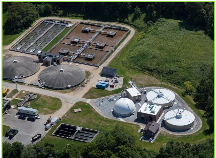
Wastewater treatment facility. The right side of the image shows the anaerobic complex where the CHP system is located.

LOCATION: Lewiston, ME MARKET SECTOR: Waste Treatment Plant FACILITY SIZE: Average 12 MGPD FUEL: Biogas (Methane) EQUIPMENT: Two 230 kW generators CHP OPERATION: 24/7 SYSTEM CAPACITY: 1,970 MWh annually PEAK LOAD: 500 kW USE OF THERMAL ENERGY: Process heat for digesters, building heat ENVIRONMENTAL BENEFITS: Reduced odor, and CO 2 emissions by 80% PROJECT COST: $15.5 million ANNUAL SAVINGS: $960,000 BEGAN CHP OPERATION: 2013