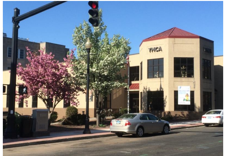
The Meridian YMCA in Connecticut uses a PACE-financed 60 kW CHP system that provides electricity and hot water.