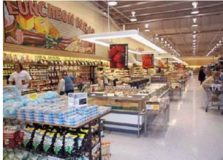
Waldbaum's Supermarket Hauppauge,